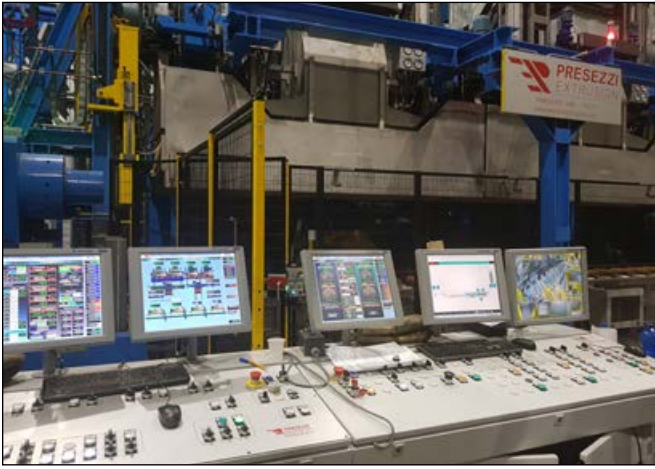
Figure 3. The 10 inch extrusion press features high levels of automation to improve production and product quality.

High Efficiency Cooling System (HECS) quenches the first 25 ft of the extruded profile using water. This is followed by multiple movable air-cooling hoods for a total length of 145 ft. Each hood can descend when needed, bringing the air flow close to the profiles to increase the cooling rate. Since the system is able to cool the profiles to a temperature below 120°F, no cooling fans are required for the cooling table, thus reducing the maintenance costs. One important feature of the quenching system is the HECS-OS optimization software, which automatically simulates and suggests the best extrusion speed and cooling parameters (air or water) to the operator, based on the shape and alloy of the profile. The use of HECS-OS combined with the Isothermal software is able to support G.James in achieving consistent quality at maximum extrusion speeds, which drastically increases the production of the entire line.