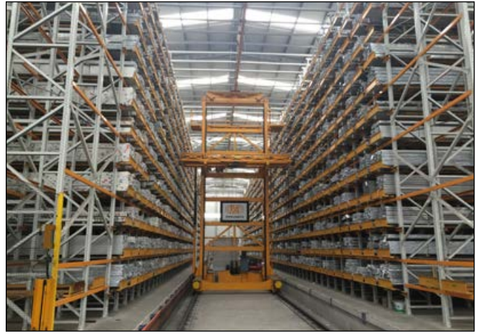
Figure 7. Packed profiles are stored in a warehouse ready for shipping.

With the installation and start up of the new 10 inch press line, the first phase of the extrusion plant expansion