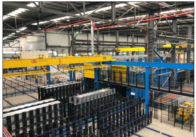
Figure 6. An overhead crane prepares baskets for loading into the aging ovens.

G.James requested side cross flow aging oven technology for its aging ovens in order to achieve flexible heat treatments with accurate temperature control for optimal heat treatment. The Prezezzi cross flow ovens feature multiple independent heating zones and fans in order to control the heat flow. It also includes an internal door that provides the opportunity to change the layout of the fur-