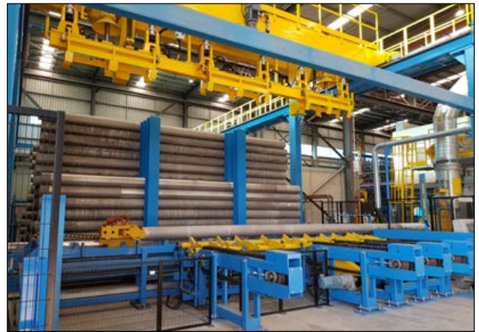
Figure 2. The vertical log storage system maintains logs until they are required by the press.

With the die in place, the DMS schedules the correct alloy from the vertical log storage system (Figure 2), which can hold up to 500 tons of aluminum billet. The vertical storage system is designed to drastically reduce manual operation, with operators only interacting with the logs to unload deliveries upon arrival at the plant. The logs are moved to a loading table, where the DMS then scans the bar code in order to move them into the appropriate place within the storage system. In this way, logs for two press lines can be handled by only a single person. Once an alloy has been scheduled, an automated crane picks up the selected log from storage and delivers it to the log heating furnace, supplied by COIM, part of the Presezzi Extrusion Group.