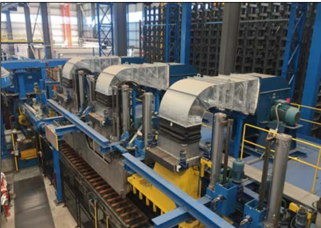
Figure 4. High efficiency quenching system.

High Efficiency Cooling System (HECS) quenches the first 25 ft of the extruded profile using water. This is followed by multiple movable air-cooling hoods for a total length of 145 ft. Each hood can descend when needed, bringing the air flow close to the profiles to increase the cooling rate. Since the system is able to cool the profiles to a temperature below 120°F, no cooling fans are required for the cooling table, thus reducing the maintenance costs. One important feature of the quenching system is the HECS-OS optimization software, which automatically simulates and suggests the best extrusion speed and cooling parameters (air or water) to the operator, based on the shape and alloy of the profile. The use of HECS-OS combined with the Isothermal software is able to support G.James in achieving consistent quality at maximum extrusion speeds, which drastically increases the production of the entire line.