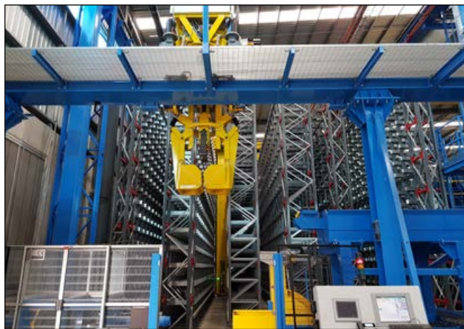
Figure 1. The automated die storage system requires minimal interaction from operators.

The automated die storage system can house up to 9,000 dies at once (Figure 1). When a profile recipe is input into the DMS, the system selects the appropriate die from the vertical storage area and transfers it to a station where the